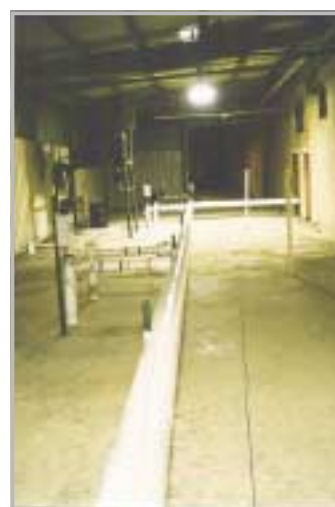
Dual Phase SVE Well Heads & Piping System

The operating SVE system is monitored continuously for vacuum, well head and total flow rates, condensate level in extraction wells, condensate volumes and system up time. The instrumentation software automatically up loads these data daily to an internet site for review and analysis.