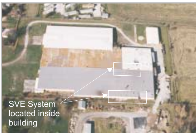
Large Manufacturing Facility

The horizontal sand filled fractures installed in the tight clay significantly increases its permeability and greatly enhances the radius of influence of the SVE extraction wells. The horizontal sand filled fractures were installed beneath the existing building and utilities. The fracture geometry was recorded in real time during injection by the active resistivity method. The horizontal fractures were installed at depths of 6', 11', 15', 19' and 23' below the existing floor slab.